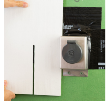
4) Install siding.