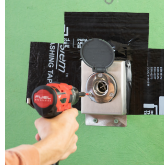
3) Attach hydrant to the mounting box with included machine screws.