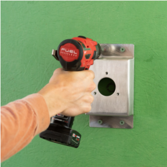
1) Secure mounting box to sheathing.