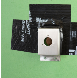
2) Use flange clearance holes to attach to sheathing. Ensure the box is installed level. Flange may be covered with liquid or tape flashing for weatherproofing. Install flange under rainscreen and siding layers. Flange should not be visible when complete.