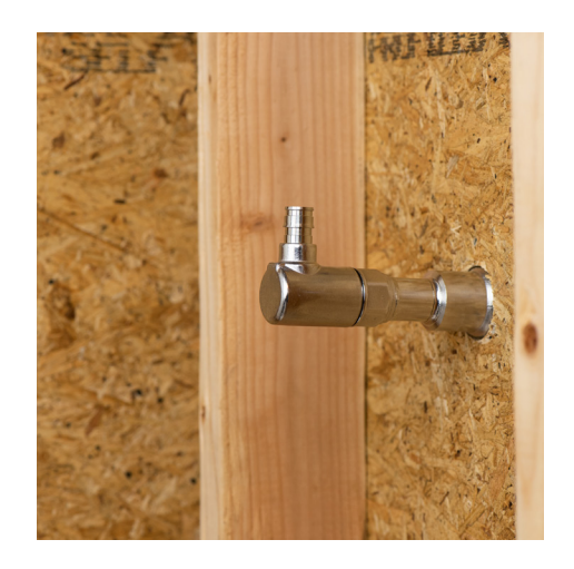
1) Remove existing inlet by unscrewing counterclockwise. Ensure the O-ring on the hydrant body is properly seated.

Note: DO NOT use Teflon tape on hydrant body threads. This may cause leaks. Only use Teflon tape on plumbing connection (fitting) threads.