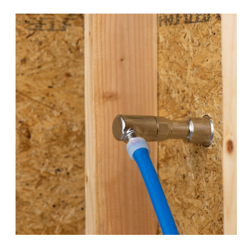
3) Attach to PEX tubing using appropriate tool and expansion ring. Check for leaks and test the hydrant operation.

Note: Elbow inlets can be positioned in any direction by rotating counterclockwise. The O-ring will keep a watertight seal up to 360° from full lock, up to 250 PSI.